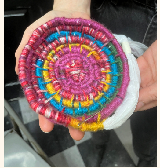
Instructor Niki English teaching a plastic bag coil basketry class, March 2025

In September 2024, Utica Creative Reuse was awarded a $19,818,72 grant by the New York State Pollution Prevention Institute to conduct a year-long series of workshops centered on reuse and repair. The Creative Reuse Workshop Series included found-object sculpture and mosaic classes, a variety of fiber arts classes, and a monthly Repair Café, where community members came together to fix items in need of mending or repair.