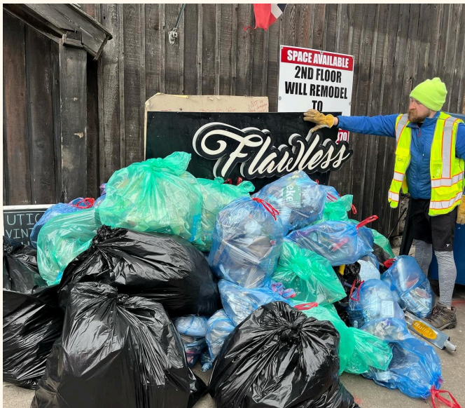
Earth Day Eve Community Cleanup, April 2024

The first Trash to Treasure Art Challenge resulted in 40 volunteers cleaning up 22 sites in Utica, and 14 participating artists creating found-object artwork for inclusion in a group gallery exhibition, a three-week event held at The Other Side gallery.