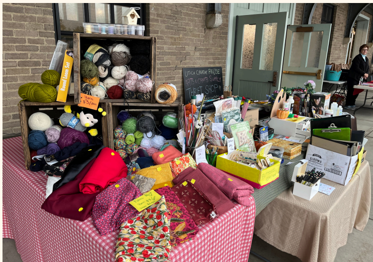
First pop-up shop at Utica Pride Festival, June 2024 (above) and Oneida County Public Market (below)

While continuing the search for a permanent location, UCR partnered with local organization to offer free programming at several locations in CNY.