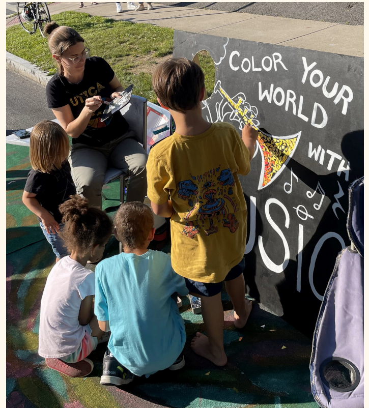
Paper mosaic activity in the Kid's Corner at a Levitt AMP concert in Kopernik Park, July 2024 (right)