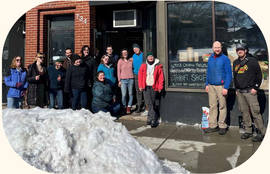
Moving Day volunteers, February 22, 2025

A generous donation from Rainbow Cupboard in Clinton supplied much of the furniture needed to get started