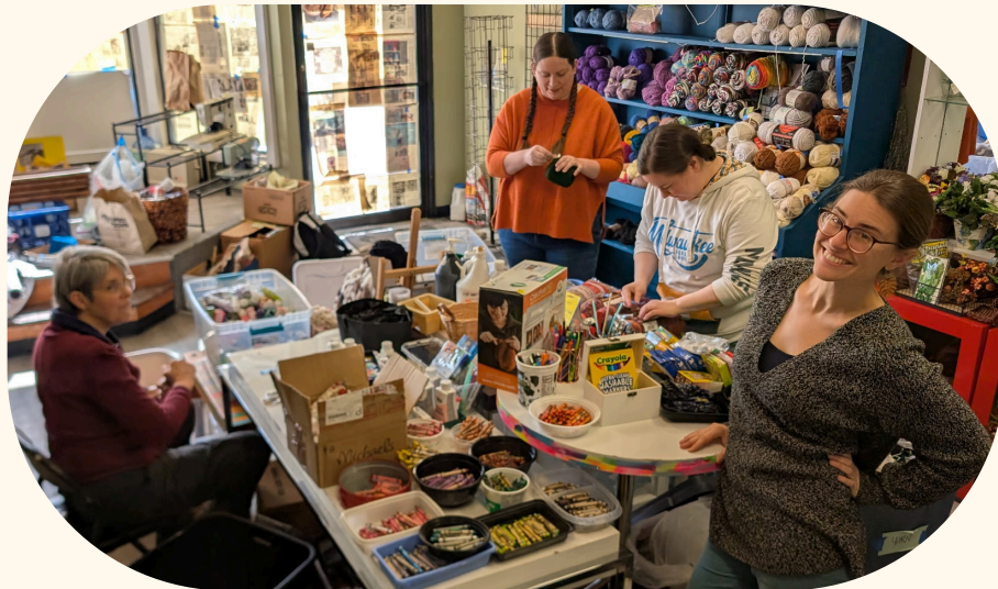
UCR's dedicated volunteers put in many long hours sorting, organizing, and pricing donations

As volunteers worked hard to unpack, sort, and organize items in the thrift store, UCR began holding events at its new location in March 2025.