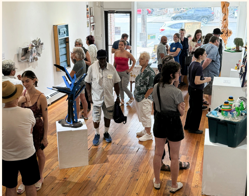
Trash to Treasure exhibition of found-object artwork at the Other Side Gallery, July 2024